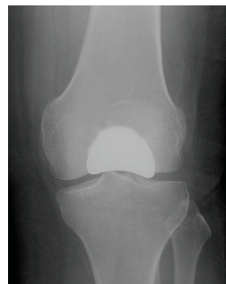
KineMatch Custom PFR, front view.