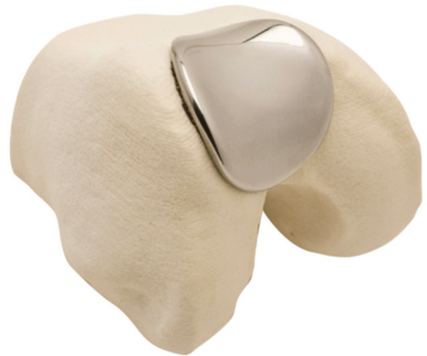
Fig. 2 – An actual custom made KineMatch PFR implant on a CT model of the patient's knee.