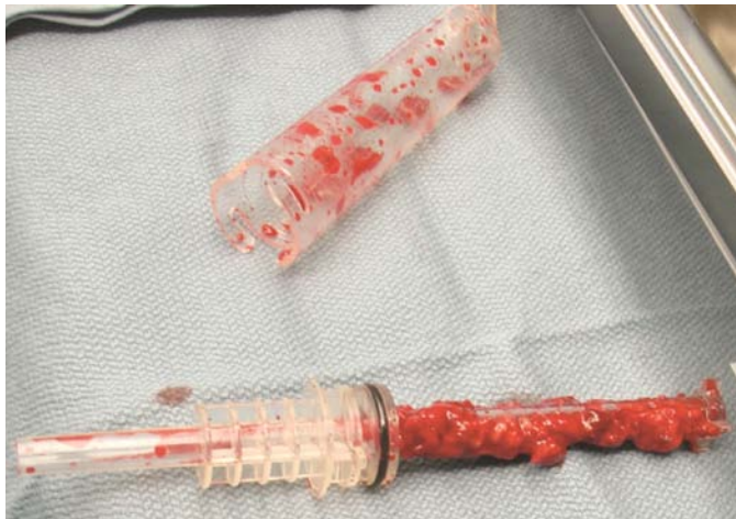
Figure 1. Discarded ‘Super Sucker’ that clogged during primary TKA; Obstruction is a relatively common occurrence.

This study evaluates the performance of a new surgical suction instrument that is designed to be self-unplugging via a mechanically activated jet of carbon dioxide (CO 2 ) gas. The tip of the instrument contains a porous metal screen that is intended to capture solid and viscous material that has been liberated from a surgical wound. The pores in the screen tip are a fraction of the inner tubing di-