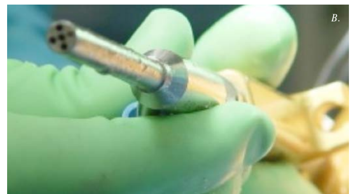
Figure 2. (A) Clogged suction tip; blockage at screen prevents continuous flow of suction. (B) Same suction tip immediately after screen has been cleared by a rapid blast of pressurized medical-grade carbon dioxide gas.