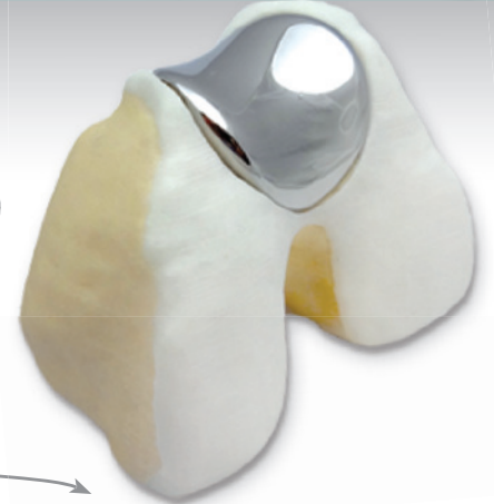
3. Implant Custom-Made for Patient Anatomy