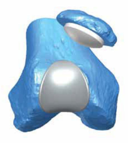
Fig. 1 – A virtual computer model of a patient's knee showing the design for the patient's KineMatch custom made implant

Partial knee replacement with the KineMatch Custom PFR is covered by most insurance plans.