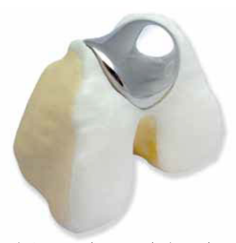
Fig. 2 – An actual custom made KineMatch PFR implant on a CT based model of the patient's knee.