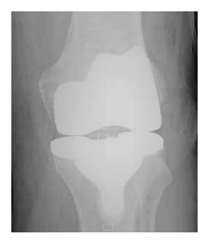
Total knee replacement, front view.