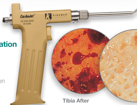
Tibia After Resection

Lassiter (2010) Intraoperative embolic events with use of pulsatile saline versus CO 2 lavage. ORS.