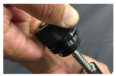
H. Observe tension reading while slowly turning knob.