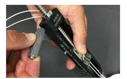
I. Pull back on lever until it stops to fully seat locking wedge.